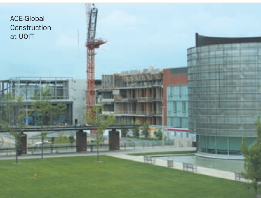
ACE-Global Construction at UOIT

The centre will conduct leading-edge research in the clean and green energies and technologies of the future economies. It will also promote Canada's entrepreneurial advantage through public-private research and commercialization partnerships. The centre will create 225 direct and 315 spinoff jobs during the construction phase and another 33 full-time, permanent positions after completion.