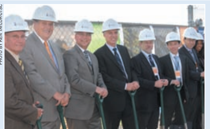
Government, faculty, student and alumni officials wielding shovels at the groundbreaking ceremony for the new Instructional Centre at the University of Toronto Scarborough campus.